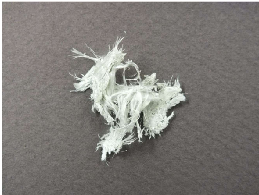
Figure 4. Photographs of non-asbestos actinolite (top, San Bernardino CA) and actinolite asbestos (bottom, HSE reference material). The asbestos appears cotton-like while the non-asbestos has a blocky appearance.