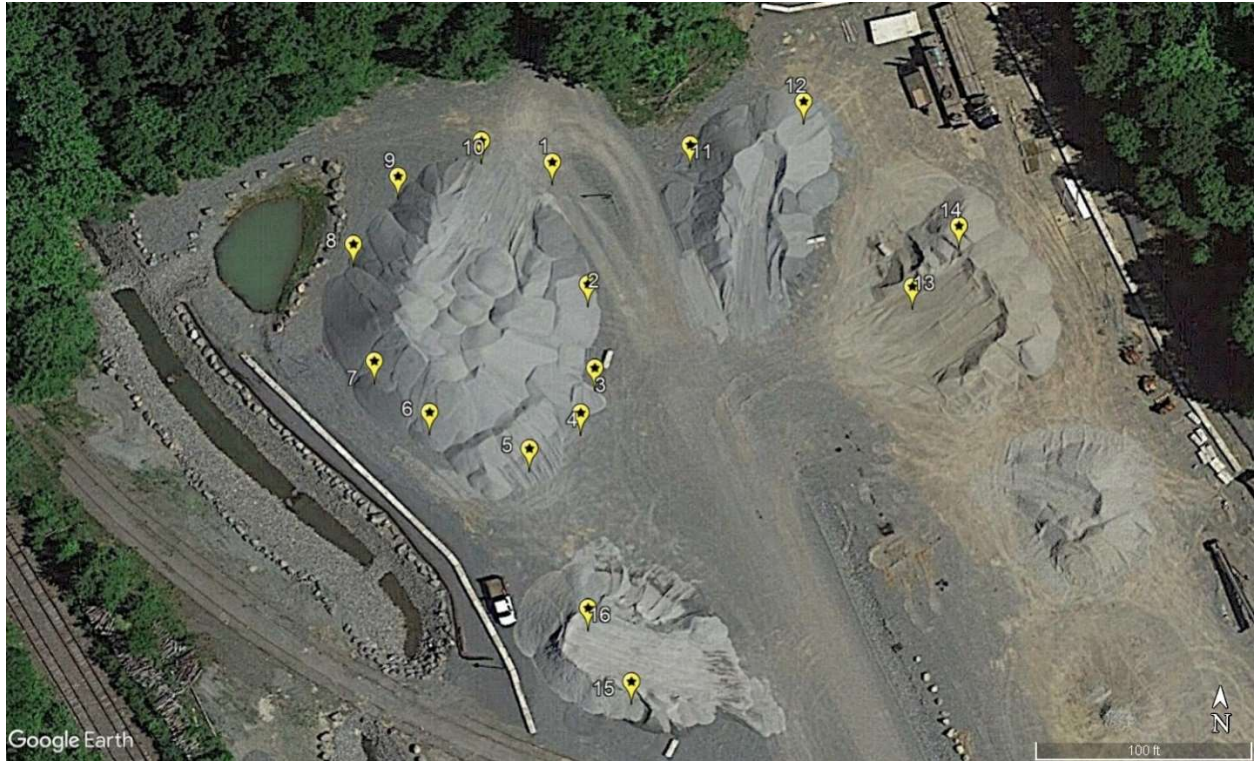
Figure 1. Map showing the locations of the stockpile samples collected at the Rock Hill Quarry. The latitude and longitude for each sample location is shown in Table 2.