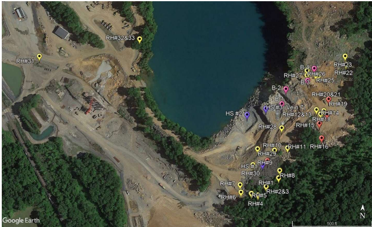
Figure 2. Map showing the locations of the boulder, dill core, and hand samples collected at the Rock Hill Quarry. The latitude and longitude for each sample location is shown in Table 2.