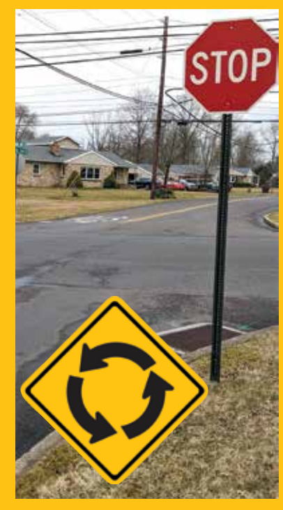
See Page 11 for Details!